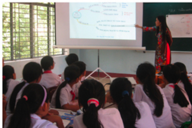
Students class 8B Nghia Thuan LSS (Tu Nghia district, Quang Ngai province) are learning using mind map.